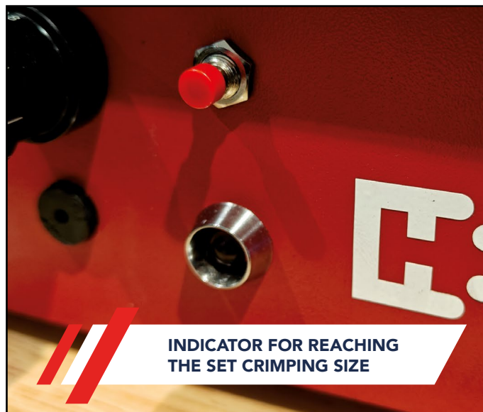
INDICATOR FOR REACHING THE SET CRIMPING SIZE