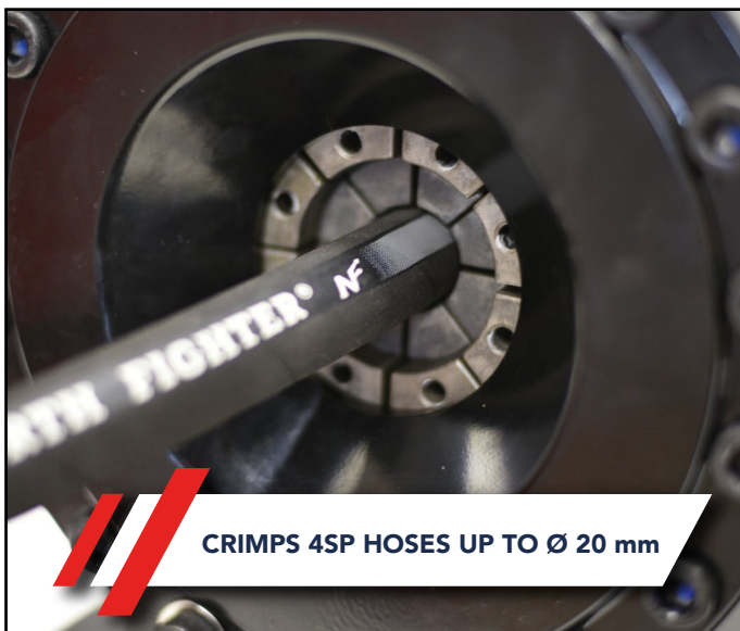
CRIMPS 4SP HOSES UP TO Ø 20 mm